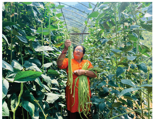
A PAP trained in commercial agriculture harvesting her produce.