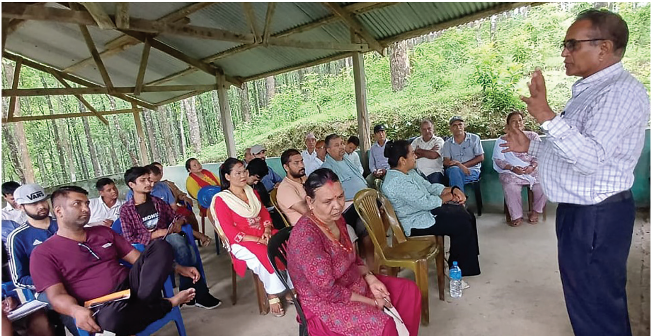
2nd round of consultation with CFUGs and LFUGs affected by the ETP in Makwanpur from 9 to 17 June 2024.