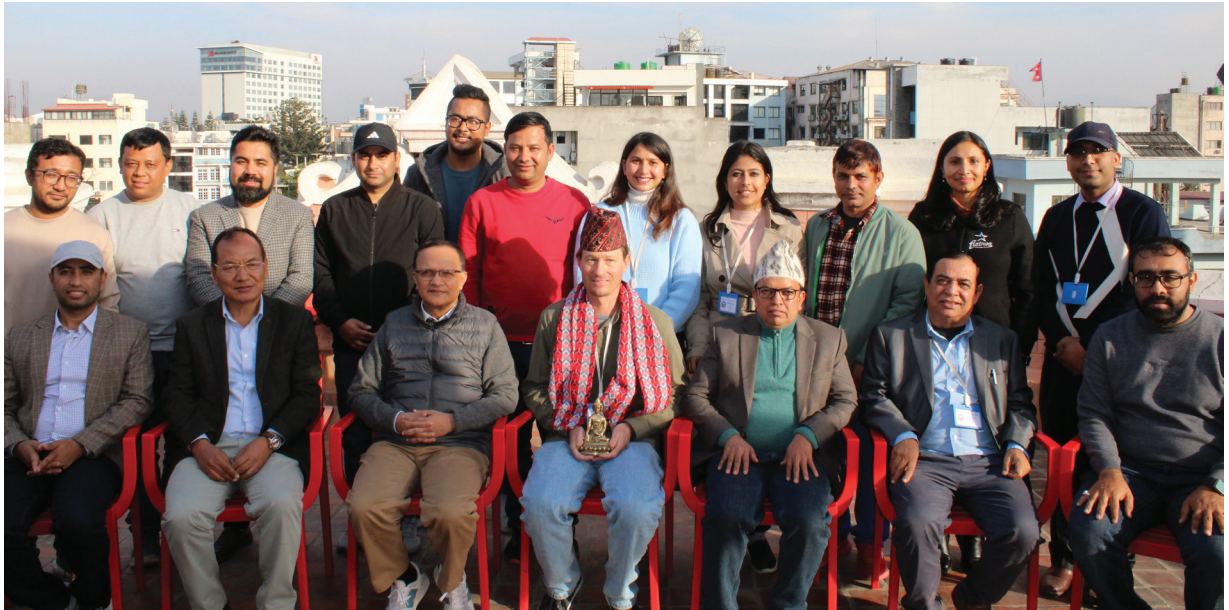
Resource persons and participants of the training on International Roughness Index Class 2 Equipment Installation and Application.