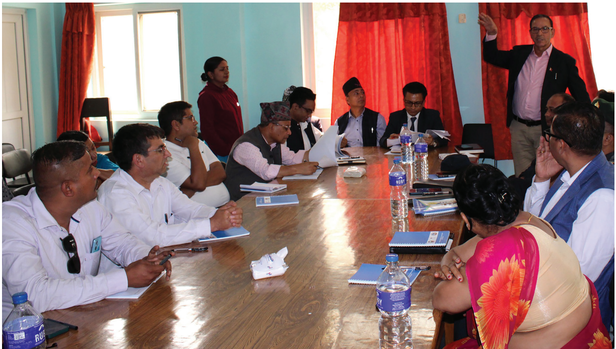
A CFC meeting to fix compensation rates of land to be acquired for the construction of TL tower pads in Dhading district on 30 April 2024.

Compensation rates of land to be acquired for the construction of TL tower pads under the ETP have been determined in Nawalparasi (Bardaghat Susta West), Makwanpur and Dhading districts.