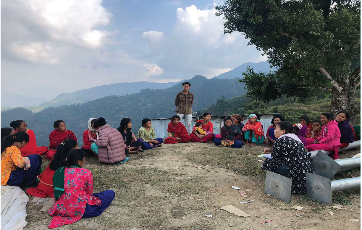
FGD with project affected women at Kailash Municipality, Makawanpur.

MCA-Nepal also organized financial literacy training for all affected families in Dhading and Makwanpur districts. The financial literacy session includes the importance of account opening in the designated bank, the significance of joint accounts, risks associated with digital banking and different saving schemes so that the received compensation amount is properly utilized by the PAPs.