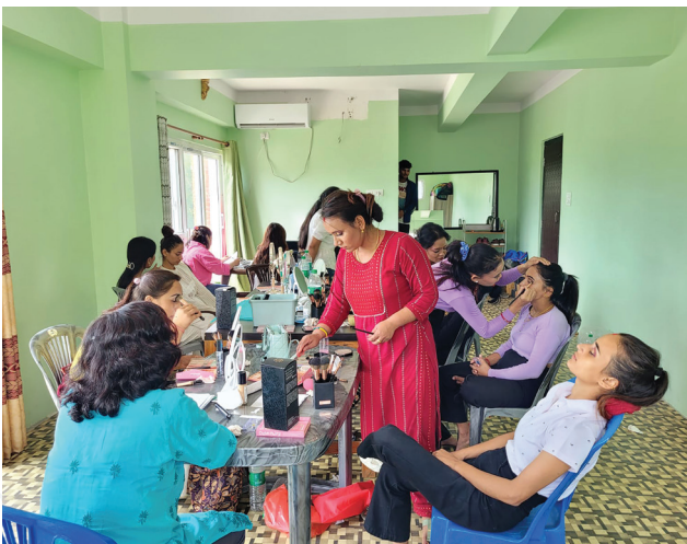
PAPs attending a beautician refresher training.