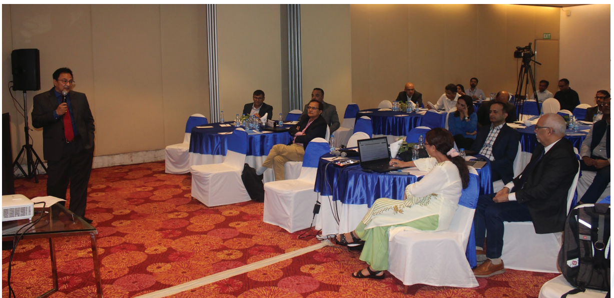
The market outreach event for the Power Sector Technical Assistance activity organized in New Delhi, India on 8 August 2023.