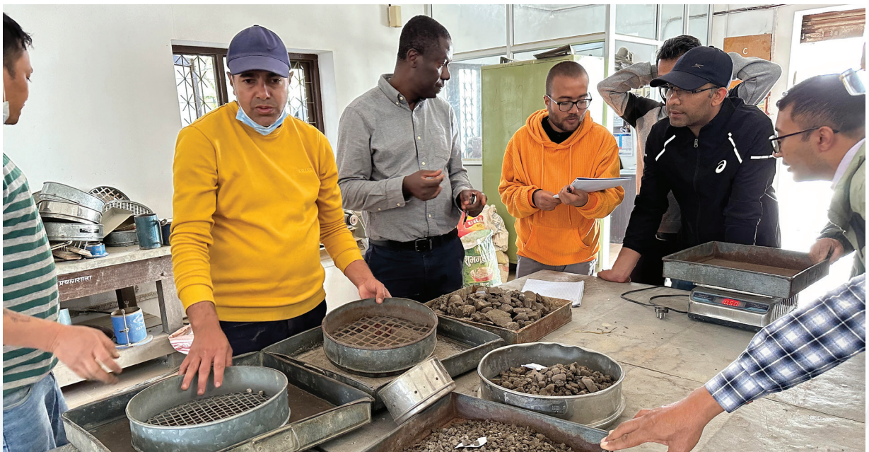
Lab technicians participating in the training from 31 October to 3 November 2023.