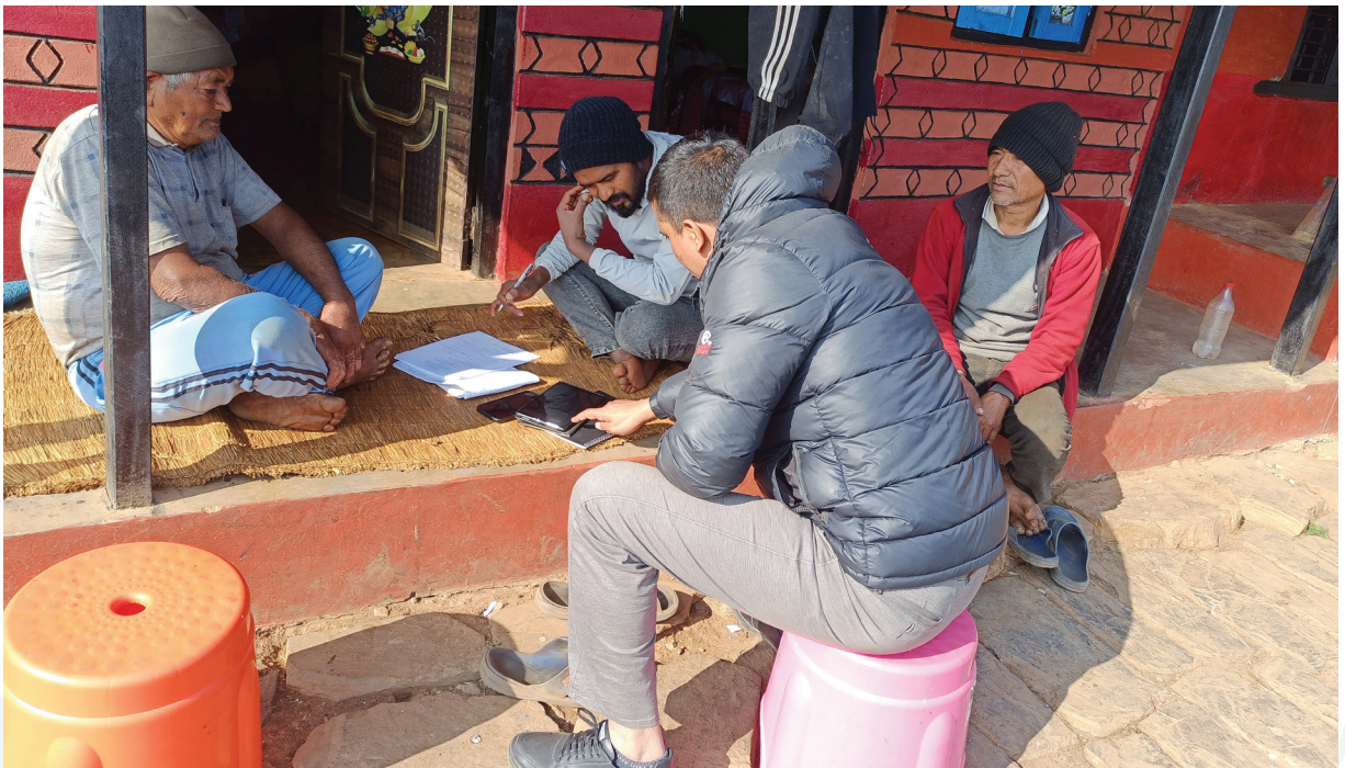
Household surveys being conducted in Tanahun district to obtain socio-cultural, demographic and economic information of project-affected families.

MCA-Nepal conducted Household and Inventory of Loss (IOL) surveys in nine out of ten ETP-affected districts to obtain socio-cultural, demographic and economic information on project-affected families as per the Resettlement Policy Framework approved by the MCA-Nepal Board of Directors. The survey is an integral part of MCA-Nepal's Resettlement Action Plan.