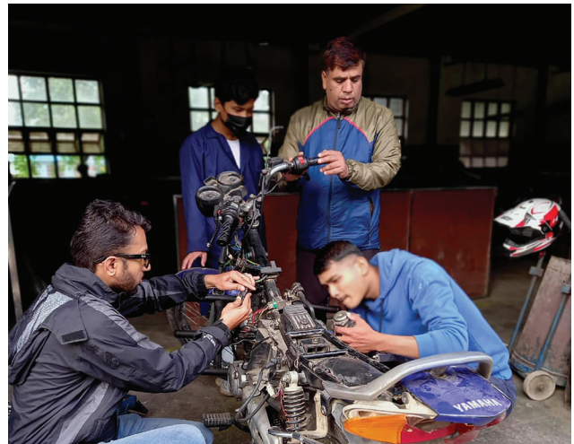
PAPS in a practical session under automobile mechanic training.