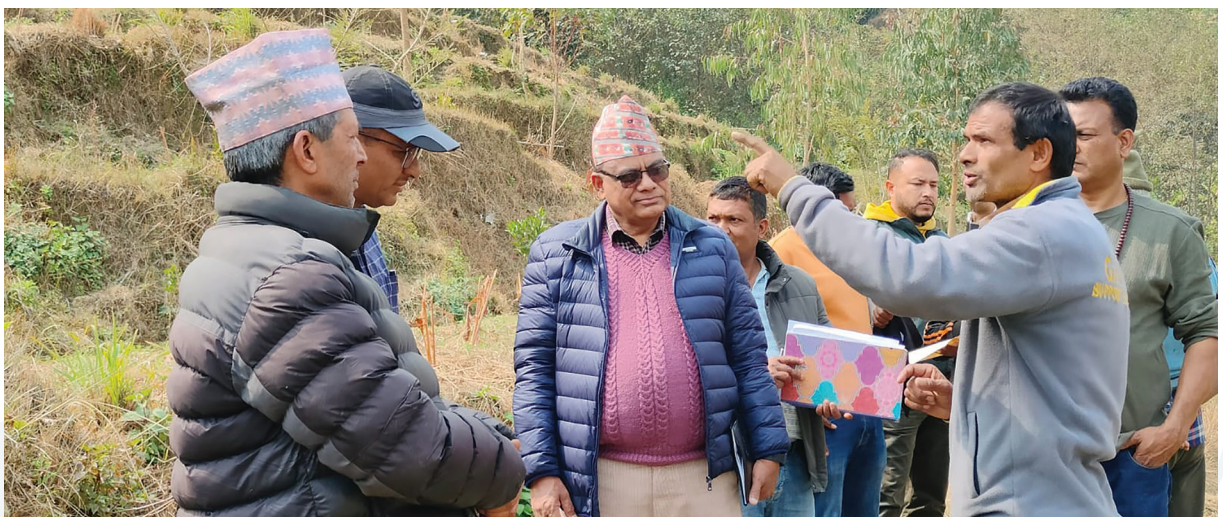
CFC Sub-committees members in Sindhupalchowk district in a field visit to verify identified lands for acquisition.