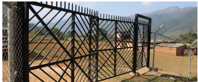
The completed boundary wall fence around 20.27 hectares of land at the Ratmate Substation construction site in Belkotgadhi, Nuwakot.

MCA-Nepal completed the erection of a chain link fence around the 20.27 hectares of land acquired by MCA-Nepal at Ratmate of Belkotgadhi Municipality-7, Nuwakot for the construction of the Ratmate Substation. The 2100 m chain link fence has been built to safeguard and secure the land in preparation for construction works.