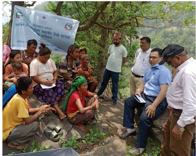
2nd round of consultation with CFUGs and LFUGs affected by the ETP in Chitwan 10 to 14 June 2024.