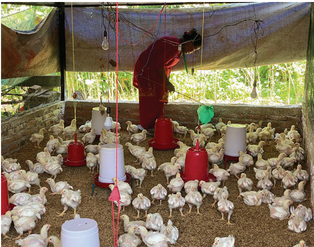
A PAP trained in poultry training attends to her chickens in her farm.

Overall, the LRP enhanced agricultural productivity leading to increased income levels, and skills development for improved employability. As an outcome, 34 PAPs have secured jobs and 39 have initiated their own businesses.