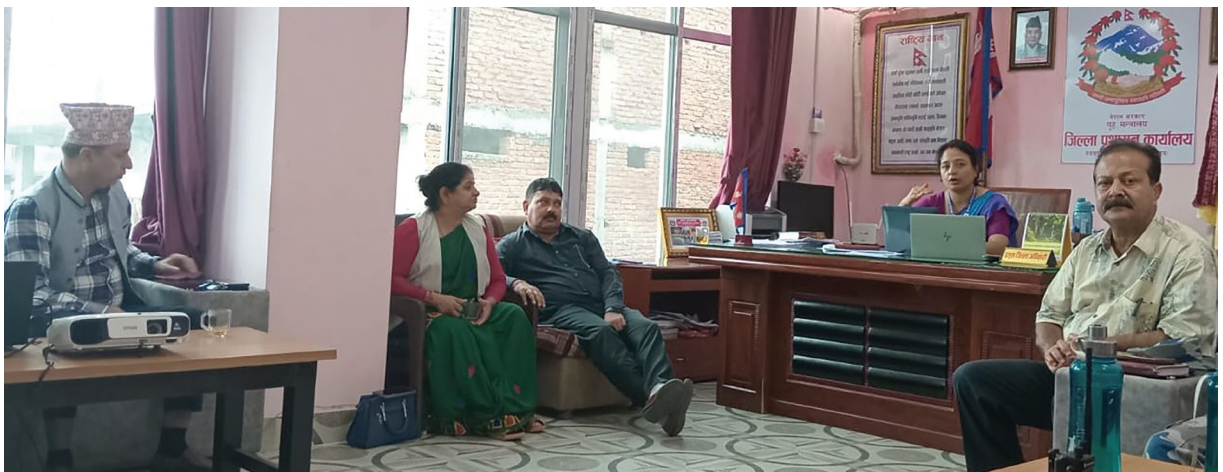
A CFC meeting to declare compensation rates of land to be acquired for the construction of TL tower pads in Nawalparasi (BSW) on 7 July 2024.