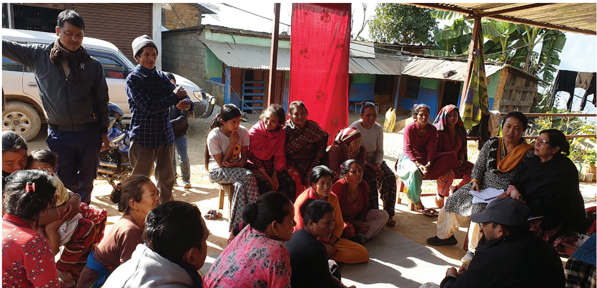
FGD with mothers' groups and members of the Community Forest Users Groups under progress in Dhading.

MCA-Nepal organized focus group discussions (FGDs) and Key Information Interviews in nine ETP-affected districts with Deputy Mayors, ward members, school teachers, and police officers to understand the social dynamics of the local community. This was carried out under the TL RAP preparation work, which requires incorporating GSI issues in order to identify the impacts of land acquisition and minimize them.