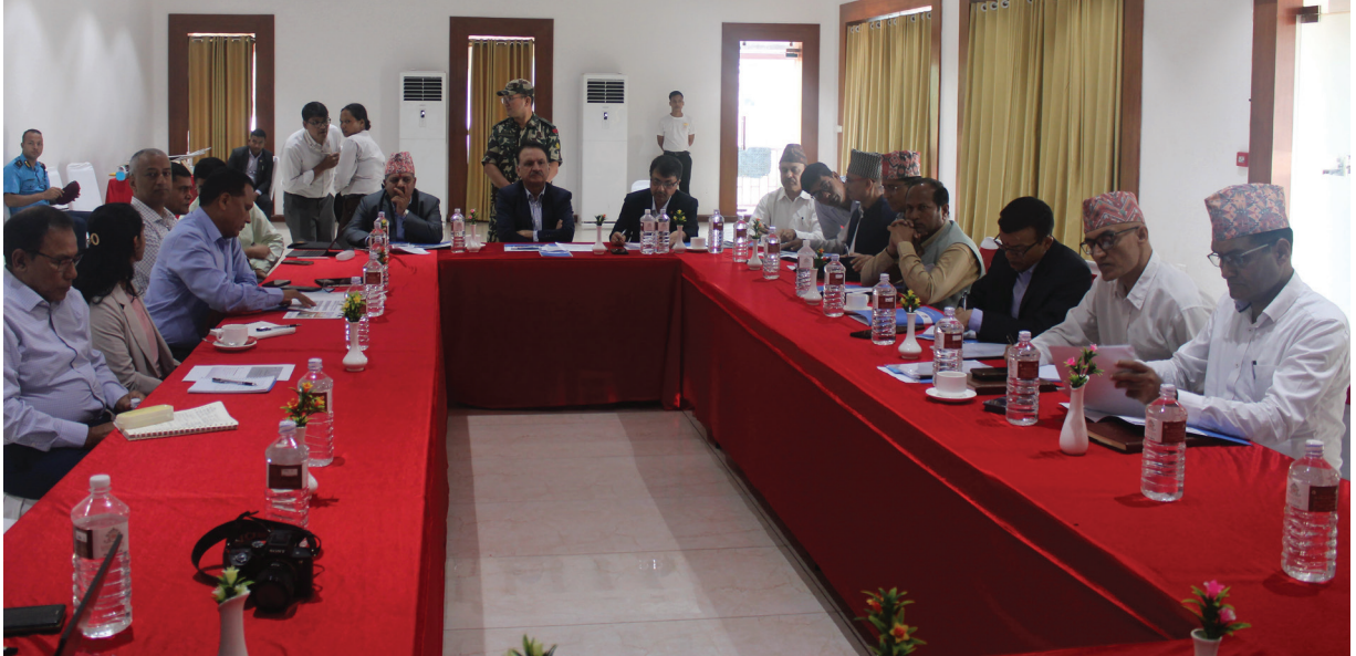
CDOs from five ETP affected districts attend a workshop to facilitate the land acquisition process in Butwal on 24 July 2023.

MCA-Nepal conducted a workshop on the land acquisition process in the second phase in Butwal on 24 July 2023 with the participation of Chief District Officers (CDOs) of Tanahun, Palpa, Nawalparasi (BSW), Makawanpur and Assistant CDO of Nawalparasi (BSE) district. The workshop, chaired by Dr. Prakash Sharan Mahat, then Finance Minister, was organized to build a common understanding of the land acquisition process.