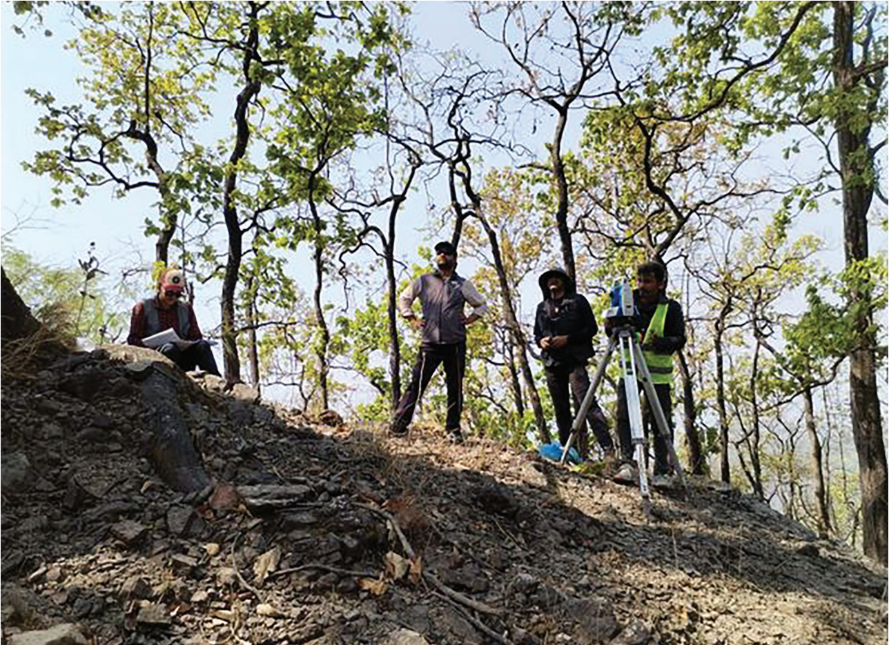
An engineering survey conducted on temporary access tracks required to construct tower pads along the transmission line route.