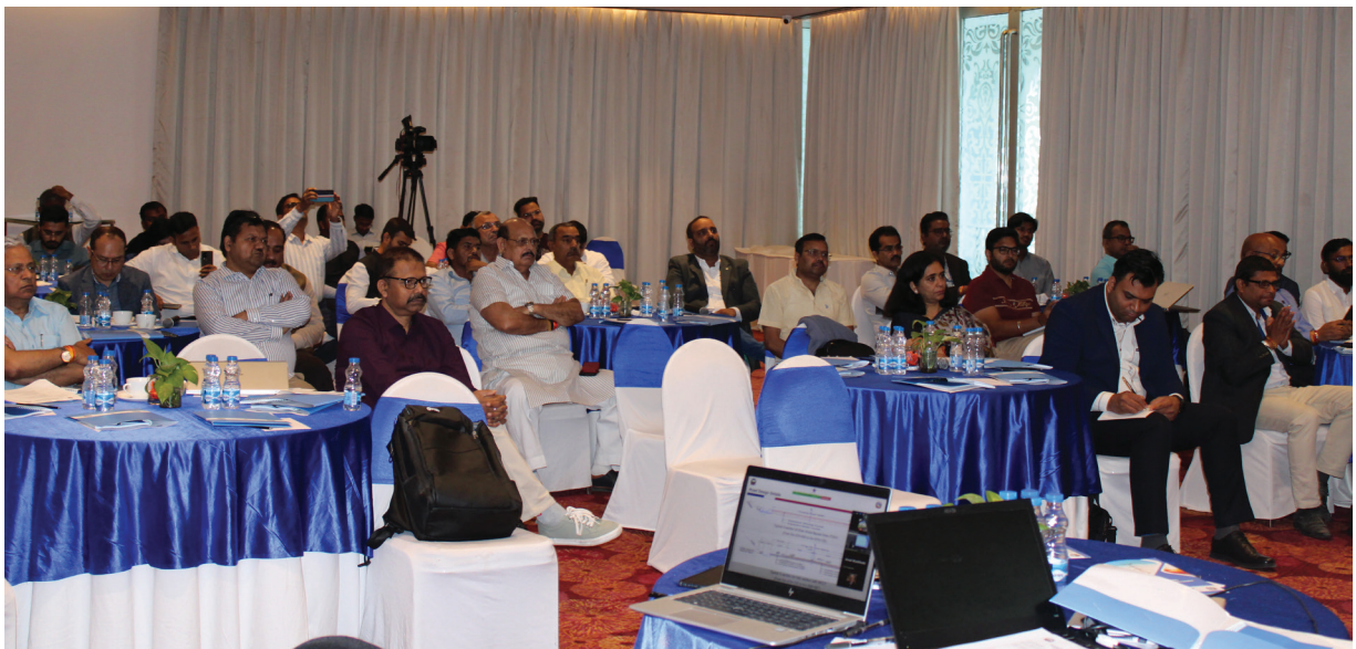
Participants at the market outreach event for the Road Maintenance Project, organized in New Delhi, India on 15 April 2024.