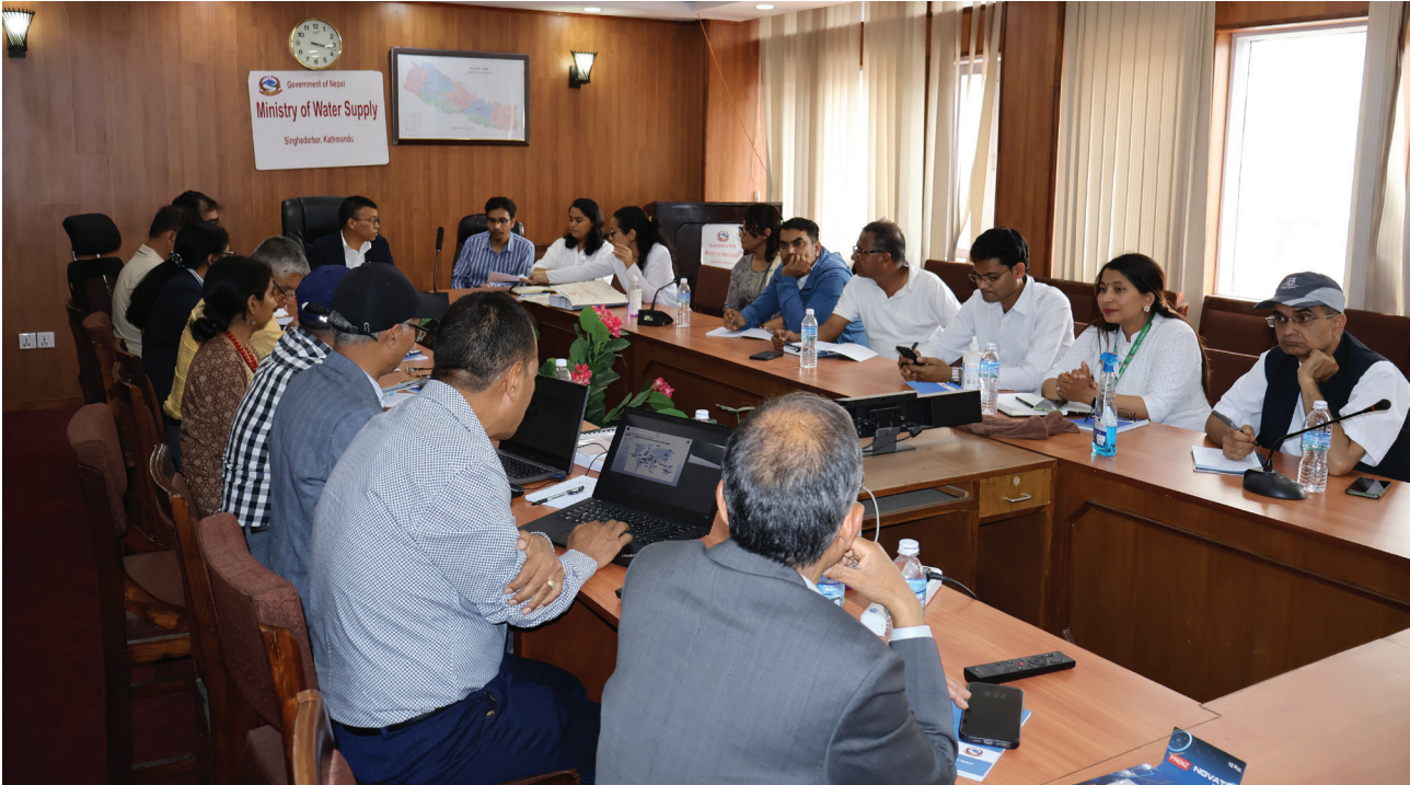
A discussion organized on the Initial Environmental Examination (IEE) report prepared for the maintenance of Dhankhola to the Lamahi segment of the East-West Highway on 2 June 2024.