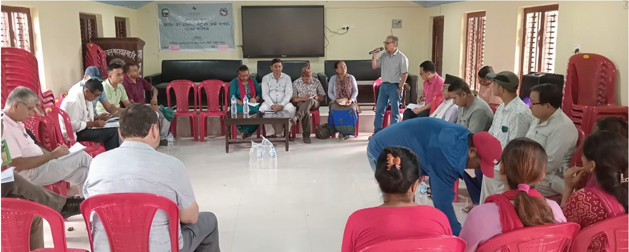
2nd round of consultation with CFUGs and LFUGs affected by the ETP in Nawalparasi (BSW) from 16 to 22 June 2024.