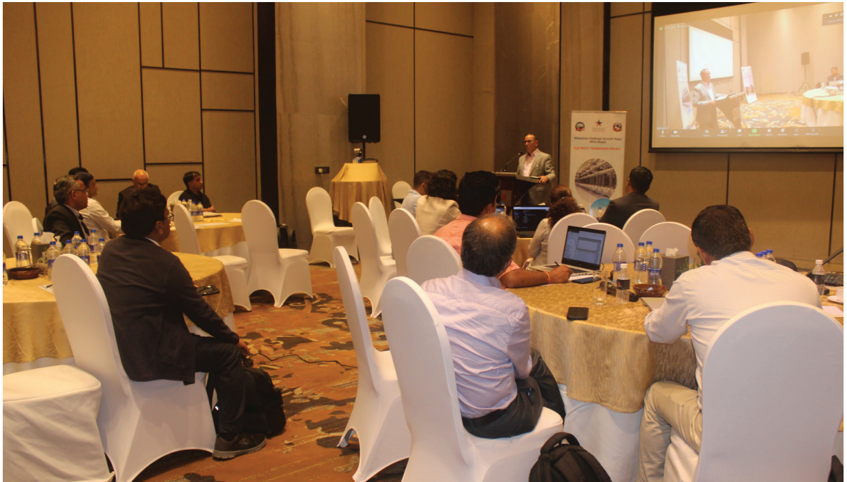
The market outreach event for the Power Sector Technical Assistance activity organized in Kathmandu on 1 August 2023.