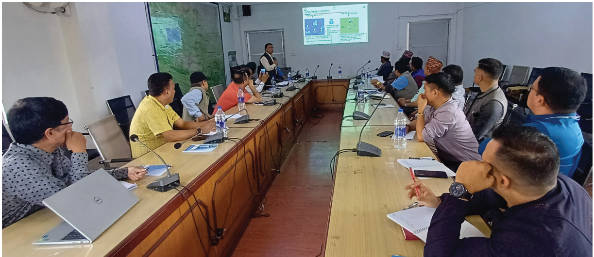
A CFC meeting to fix compensation rates of land to be acquired for the construction of TL tower pads in Makwanpur district on 10 May 2024.

Earlier, MCA-Nepal organized field visits for subcommittees, formed under the CFCs and led by the Assistant Chief District Officers of these districts to recommend the compensation for land. Officials from related government agencies alongside elected representatives were part of the visit.