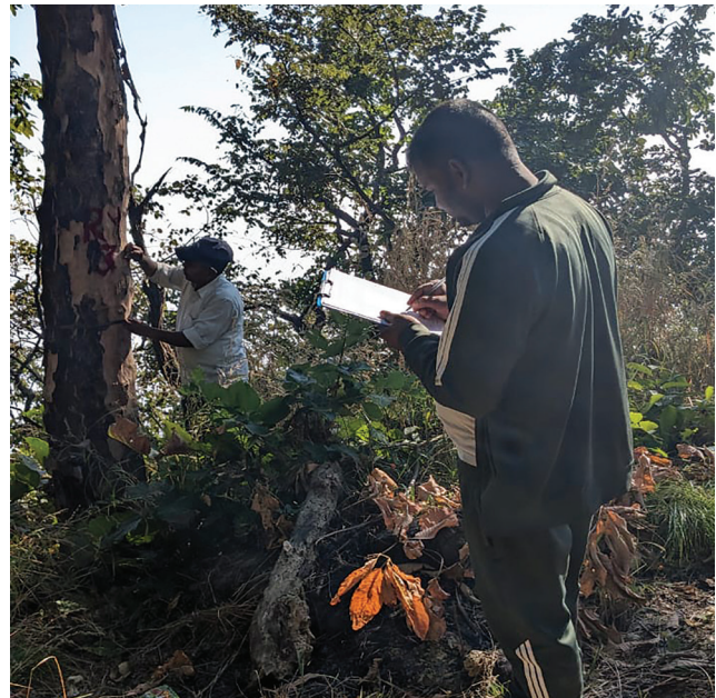
The forest census works carried out in Nawalparasi (Bardaghat Susta West).

Soon after orientations to the DFO-led census team the orientation, MCA-Nepal mobilized its team to enumerate trees along the ETP segment to verify the forest area and trees estimated in the EIA. The census started from Dhading and three teams were mobilized in three different districts for the census. Similarly, the technical team was also mobilized to establish the permanent control points were established for the demarcation of the forest area to enumerate and verify the trees in the ETP districts. The technical team completed the forest census work was completed in by May 2024 except in nine out of ten affected Kathmandu districts.