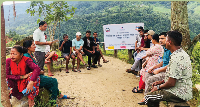
2nd round of consultation with CFUGs and LFUGs affected by the ETP in Nuwakot.