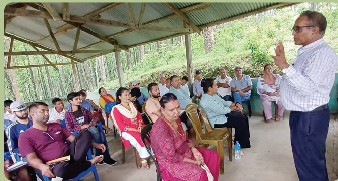
2nd round of consultation with CFUGs and LFUGs affected by the ETP in Makwanpur.