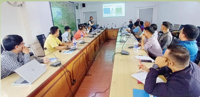
A meeting to declare compensation rates of land to be acquired for the construction of TL tower pads in Makwanpur on 10 May 2024.