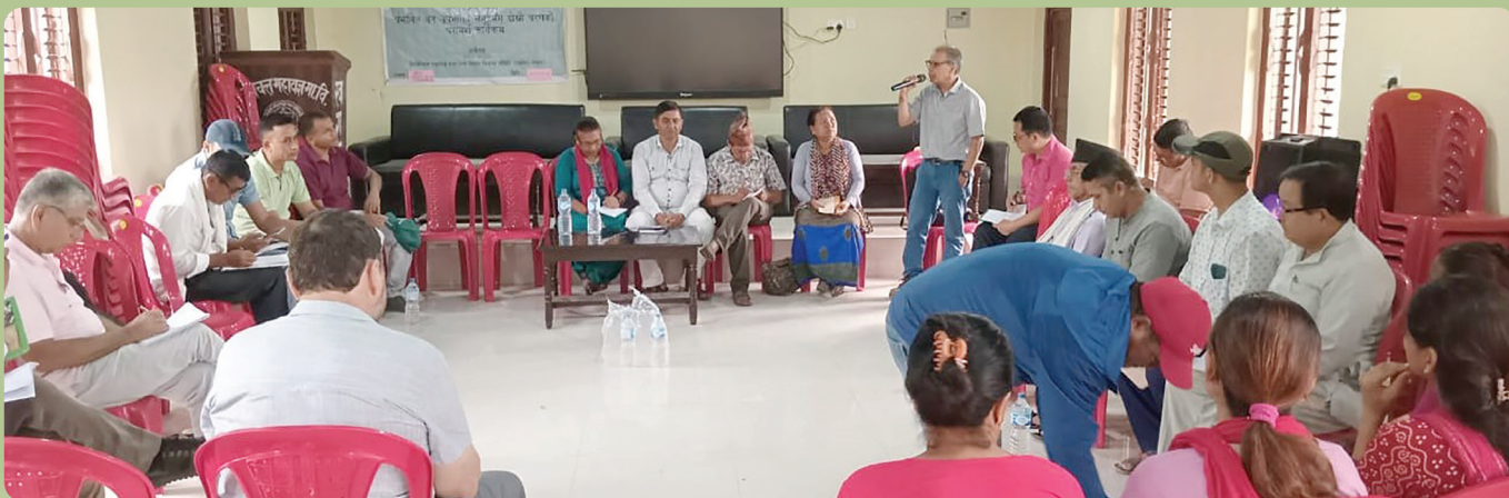
2nd round of consultation with CFUGs and LFUGs affected by the ETP in Nawalparasi (BSW).