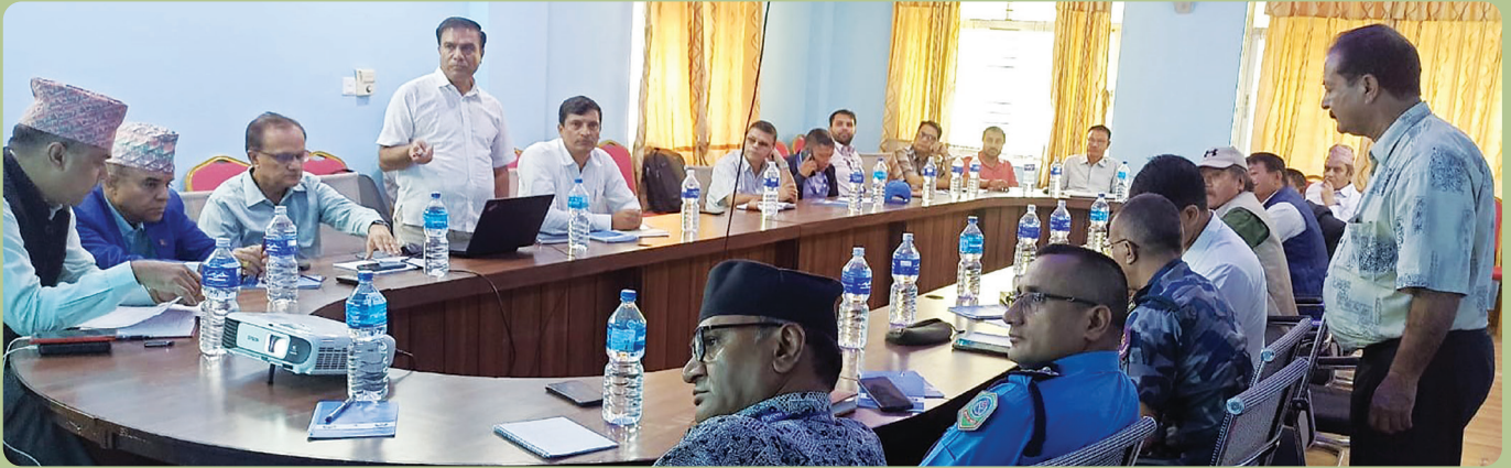
A meeting to declare compensation rates of land to be acquired for the construction of TL tower pads in Chitwan on 13 September 2024.