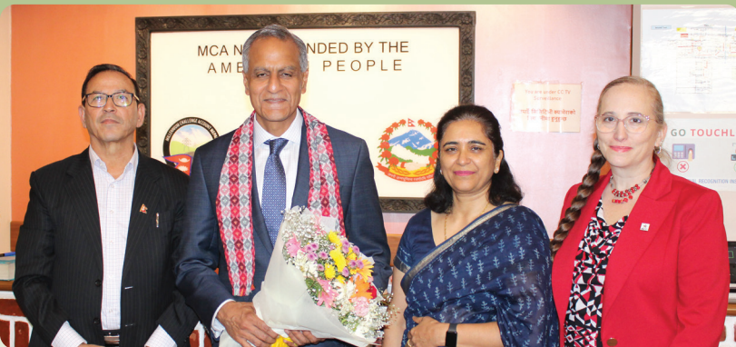
Mr. Richard R. Verma, the Deputy Secretary of State for Management and Resources of the U.S. Government, with MCC and MCA-Nepal executive team during a visit to MCA-Nepal on 16 August 2024.

Mr. Richard R. Verma, the Deputy Secretary of State for Management and Resources of the U.S. Government, visited MCA-Nepal on 16 August 2024.