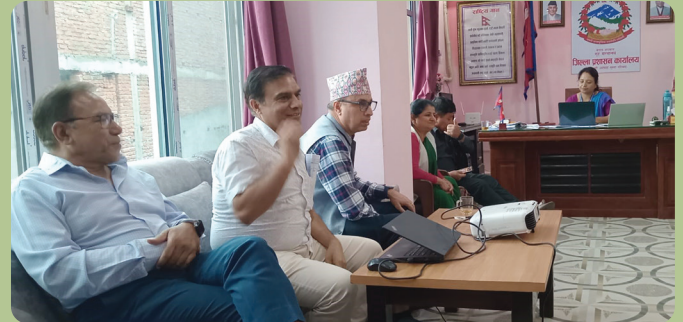
A meeting to declare compensation rates of land to be acquired for the construction of TL tower pads in Nawalparasi (BSW) on 7 July 2024.