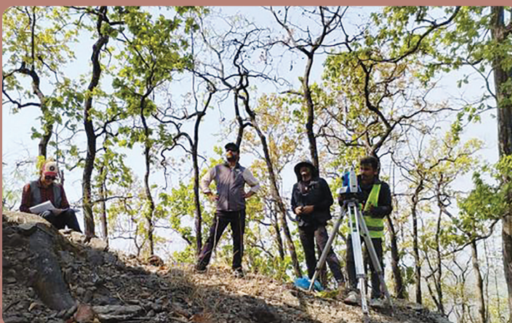
Engineering survey on temporary access tracks required for the construction of tower pads along the route of the transmission line being conducted.

MCA-Nepal has completed an engineering survey on temporary access tracks required for the construction of tower pads along the route of the transmission line (TL) to be built under the ETP. The survey carried out in eight districts was completed on 25 April 2024. Additionally, an environmental and social assessment survey for selected temporary access tracks in the eight districts was also carried out and completed in August 2024.