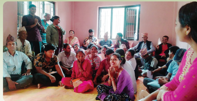
2nd round of consultation with CFUGs and LFUGs affected by the ETP in Dhading.