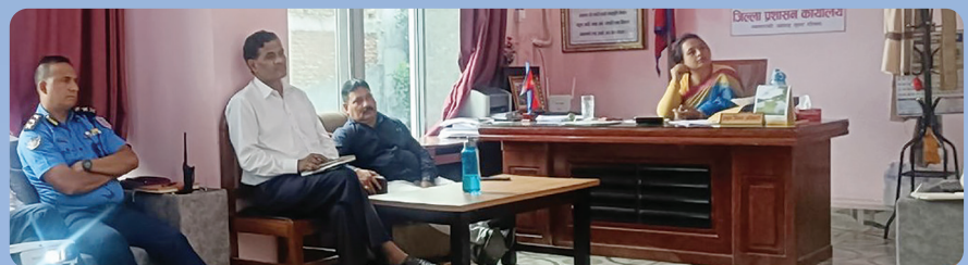
A meeting to disclose a Resettlement Action Plan (RAP) and Livelihood Restoration Plan (LRP) in the CDO's office in Nawalparasi (Bardaghat Susta West) district on 16 September 2024.

At the disclosure event, participated by the Chief District Officer (CDO), elected representatives and local officials, a summary of the RAP and LRP report on affected