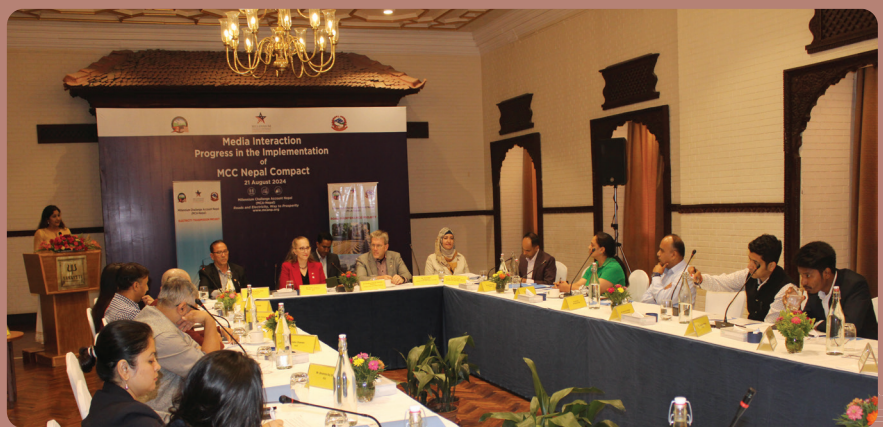
The media interaction jointly organized by MCA-Nepal and the US Embassy in Nepal on 21 August 2024.