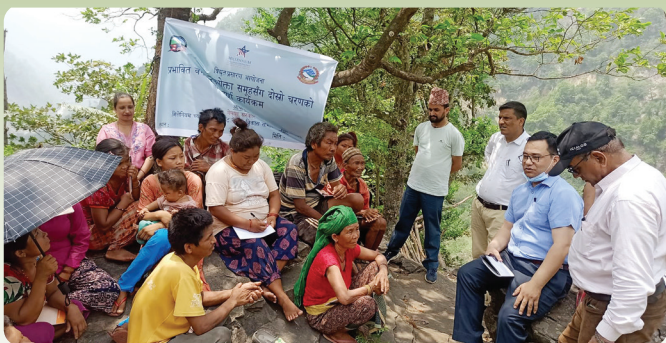
2nd round of consultation with CFUGs and LFUGs affected by the ETP in Chitwan.