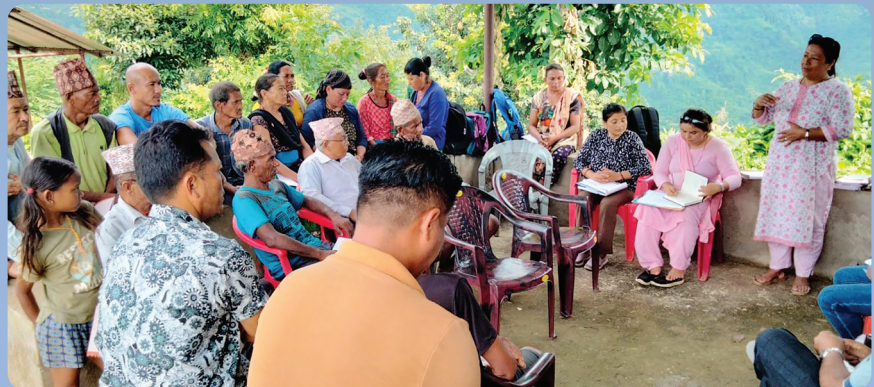
2nd round of consultation with CFUGs and LFUGs affected by the ETP in Palpa.

MCA-Nepal conducted the second round of consultations with CFUGs and LFUGs affected by the ETP in Sindhupalchowk district on 30 September, in Palpa district from 23 August to 6 September, in Tanahun district from 23 August to 5 September and Nuwakot district from 21 August to 26 September 2024.