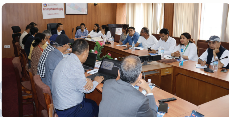
A meeting on the Initial Environmental Examination (IEE) report prepared for the maintenance of Dhankhola to the Lamahi segment of the East-West Highway at MoPIT on 2 June 2024.

The report will help MCA-Nepal adopt measures to reduce the negative impact of the project on the environment and the community.