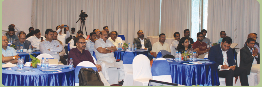
Participants at the market outreach event on the upcoming procurements related to the Road Maintenance Project, organized in New Delhi, India on 15 April 2024.

and potential bidders provided detailed information on the objective of the procurements and its timeline to potential bidders alongside necessary procurement procedures, principles and guidelines of