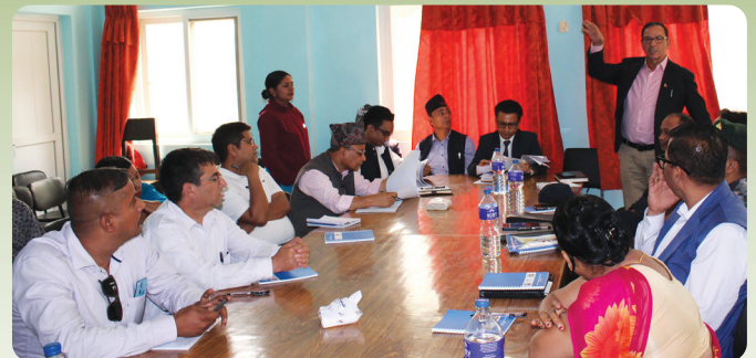
A meeting to declare compensation rates of land to be acquired for the construction of TL tower pads in Dhading district on 30 April 2024.