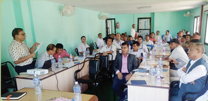
A meeting to declare compensation rates of land to be acquired for the construction of TL tower pads in Tanahun on 11 September 2024.