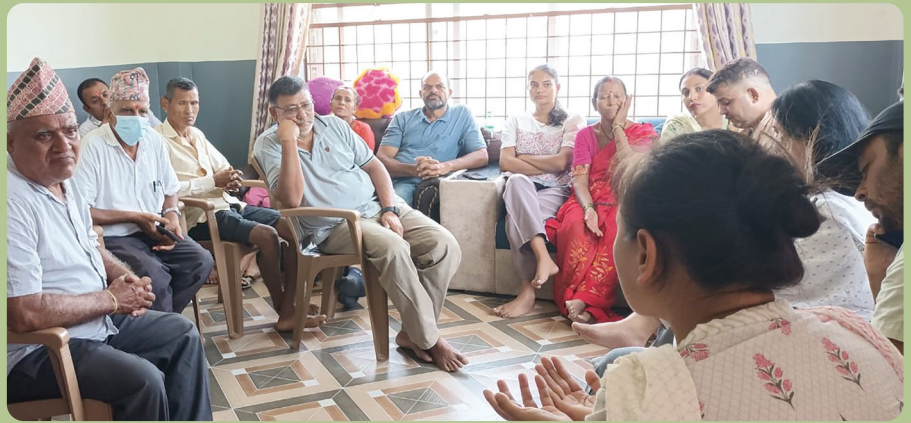
A financial literacy program, organized for project-affected people in Nawalparasi (BSW) district on 7 August 2024, in progress.

financial literacy programs as a part of its Resettlement Action Plan (RAP) across all ten districts