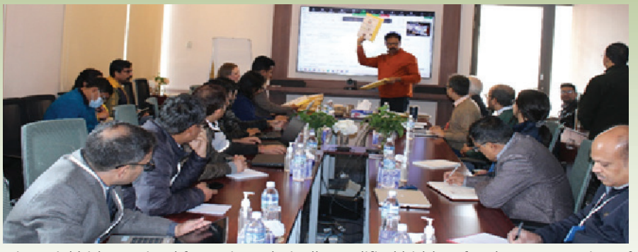
Financial bids received from six technically qualified bidders for the construction of three substations being opened on 26 February 2024.

The procurement for the plant design, supply, delivery, installation, testing and