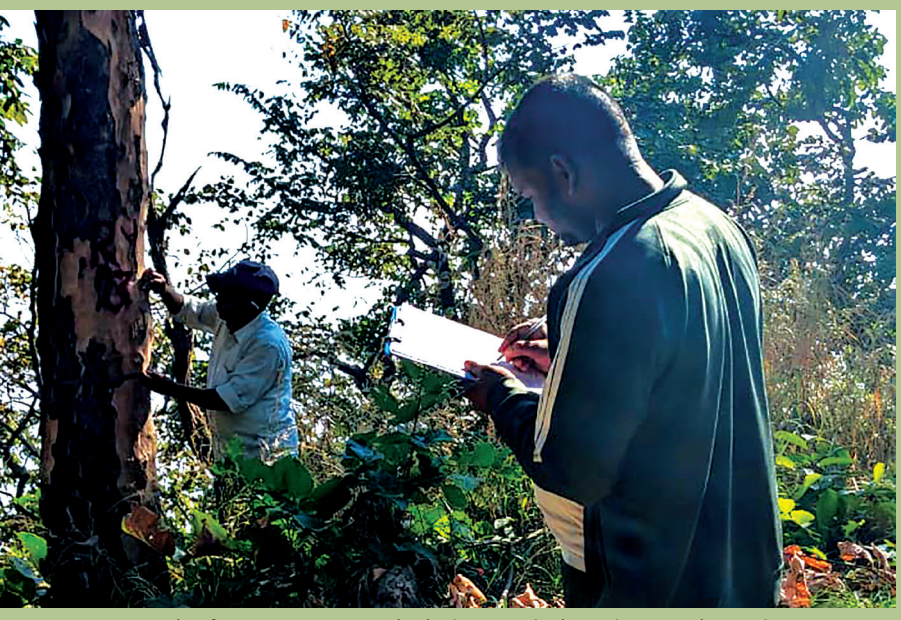
The forest census works being carried out in Nawalparasi (Bardaghat Susta West) district.

The census will be carried out in all ten districts where the Electricity Transmission Project will be implemented.