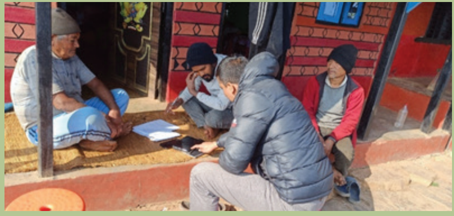
Household surveys being conducted in Tanahun district to obtain socio-cultural, demographic and economic information of project-affected families.

Such surveys have been carried out in nine districts to be affected by the construction of transmission lines. The survey is an integral part of MCA-Nepal's Resettlement Action Plan.