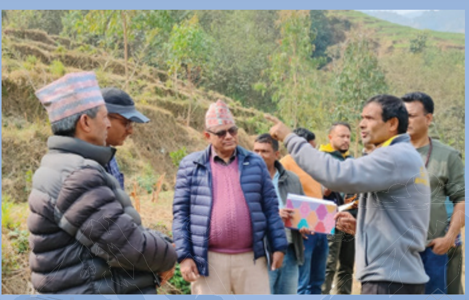
CFC Sub-committee members in Sindhupalchowk district during a field visit to verify identified lands for acquisition.

Officials from related government agencies alongside elected representatives were a part of the visits organized by MCA-Nepal.