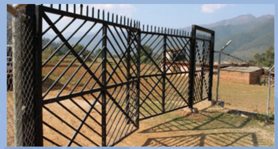
The Completed boundary wall fence around 20.27 hectares of land at the Ratmate Substation construction site in Belkotgadhi, Nuwakot.

Ratmate Substation is one of the three 400 kV substations to be constructed under the Electricity Transmission Project.