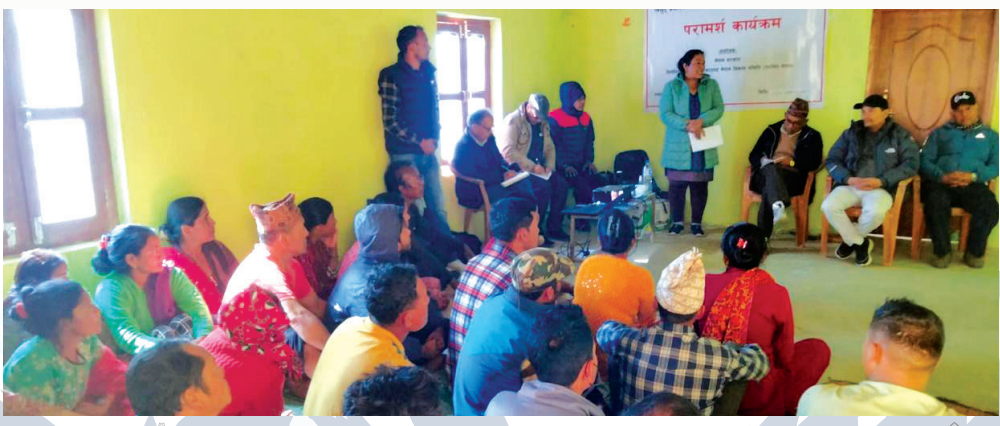
The additional consultation meeting organized with Community Forest User Groups (CFUGs) in Siddhalekh, Dhading.