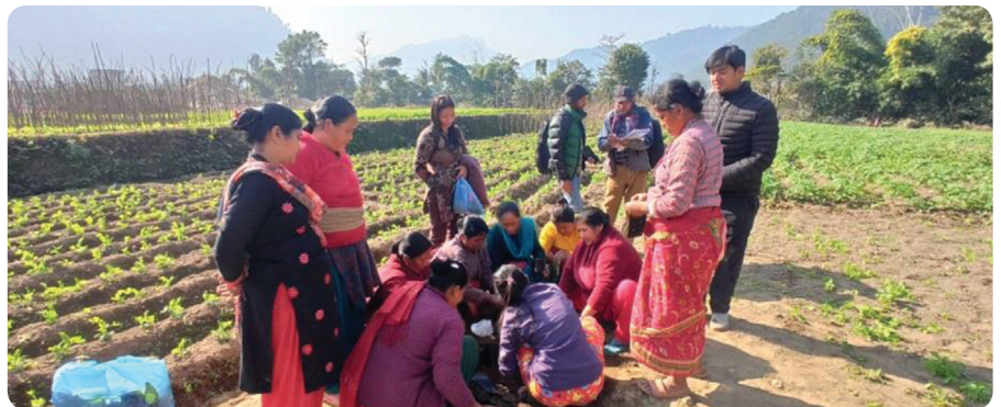
Project affected people attending the practical session of the training.