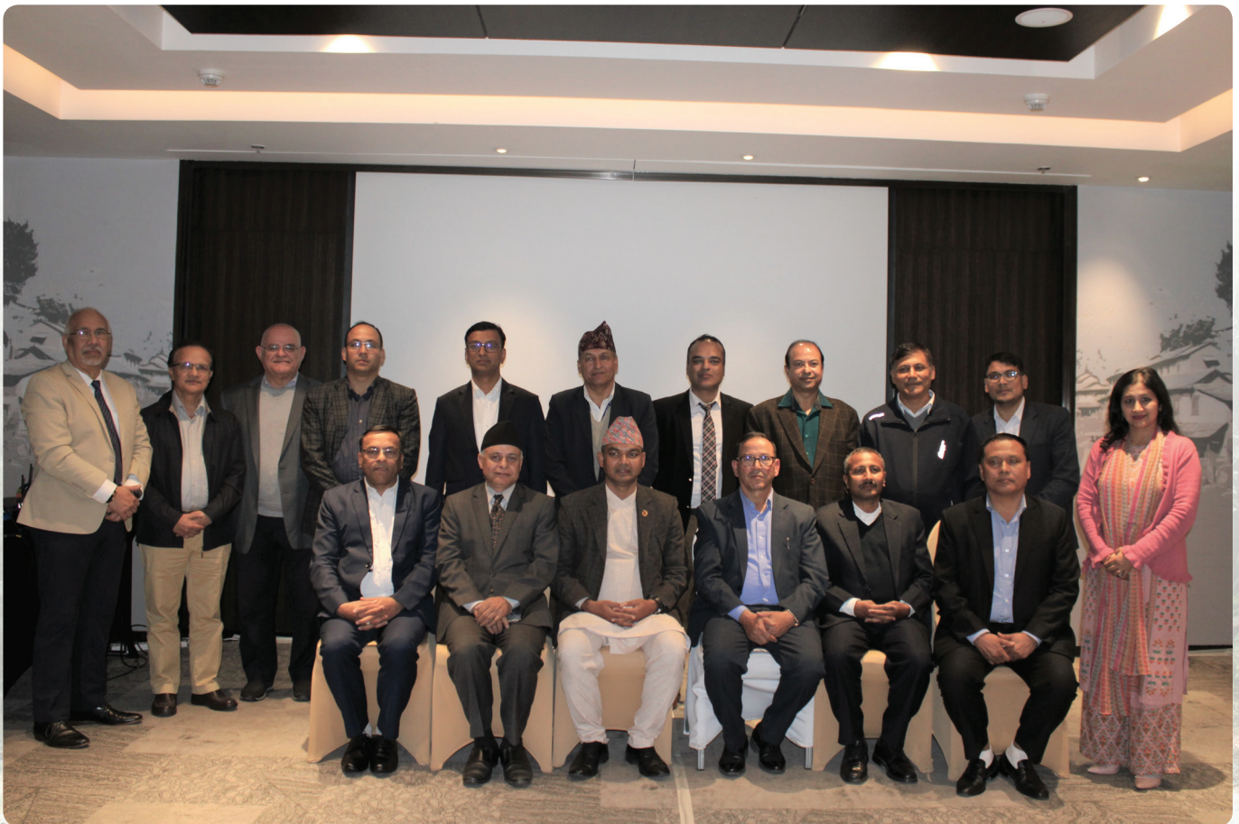
Participants and resource persons at the orientation.

the Ministry of Finance and the Chairperson of MCA-Nepal Board, shared that the MCC Nepal Compact will contribute significantly to the infrastructure development of Nepal, and the Government of Nepal was committed to its successful implementation.