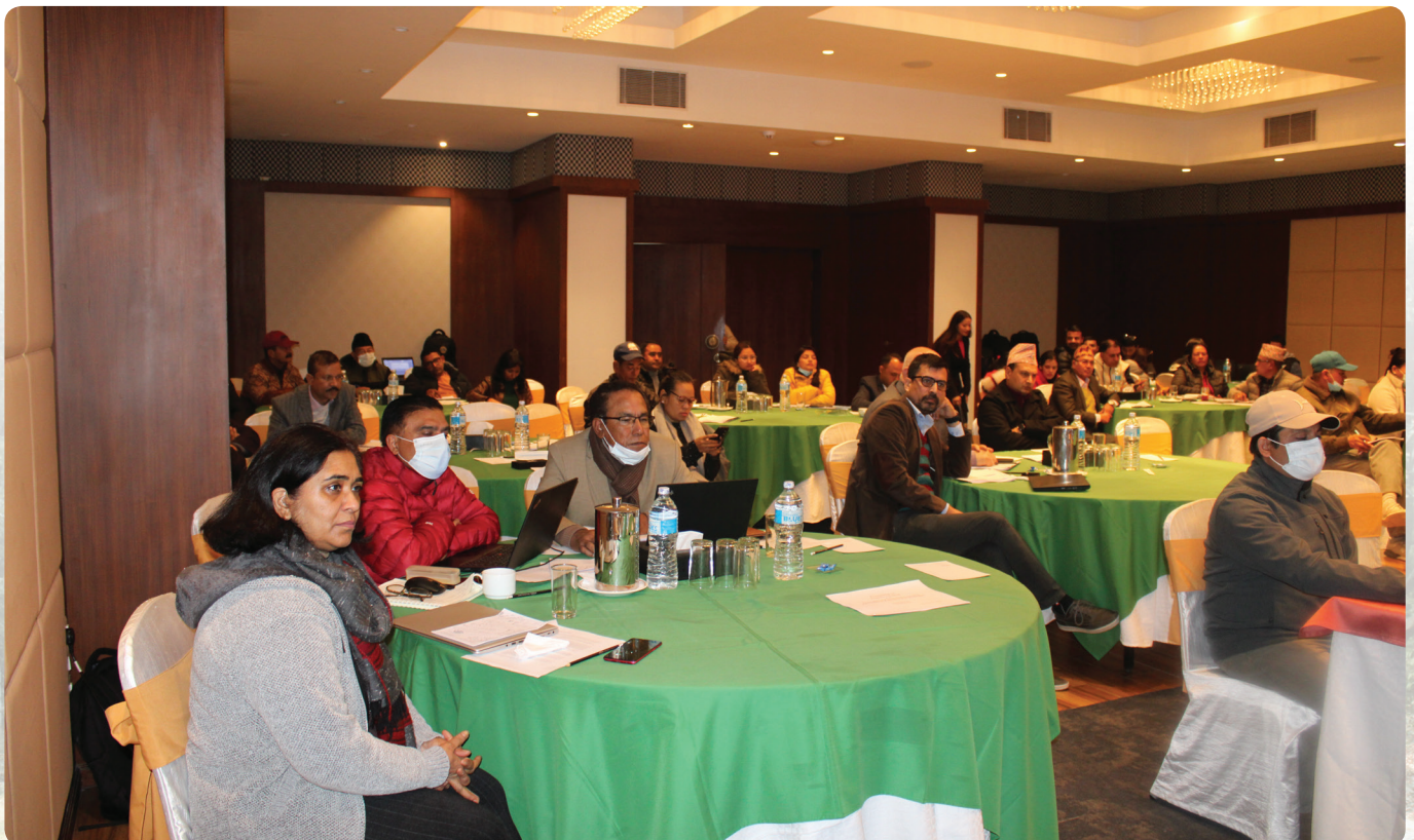
Participants at the Inception Workshop.

Ltd was selected to provide consultancy services for the preparation and implementation of TL RAP and LRP. The activities under RAP and LRP will avoid and/or minimize any adverse involuntary resettlement and livelihood impacts on the project-affected people in 10 districts of Nepal along the route of the transmission line.