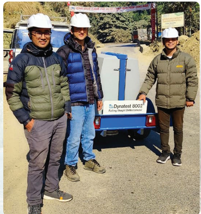
A team from the Department of Roads measuring pavement deflection at Dhan Khola to Lamahi section of East-West Highway.