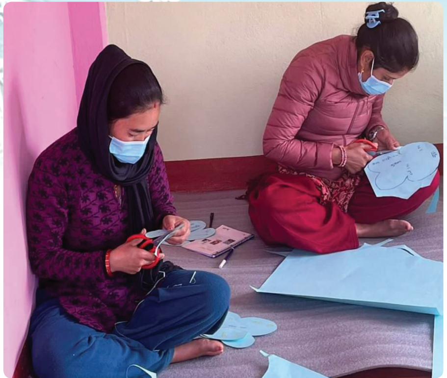
Participants at the two-month long Doll and Cushion Making Training

Furthermore, MCA-Nepal conducted a one-day training on the Prevention of Sexual Exploitation, Harassment and Abuse for SAPPROS board members, senior management team members, staff and the LRP implementation team on 26 December 2022.