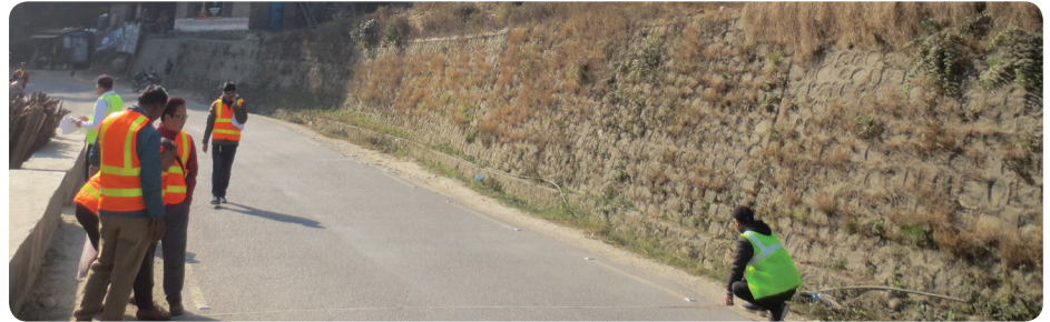
MCA-Nepal team conducting an asset verification and socio-economic survey.