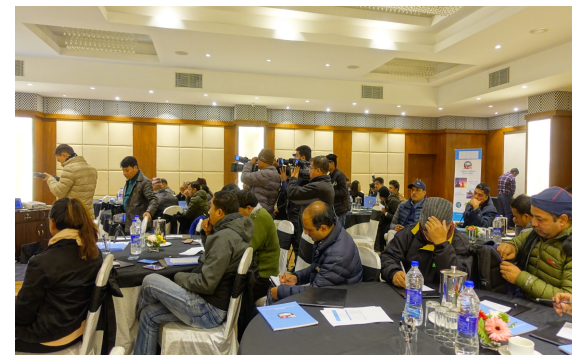
Participants during the Q & A session.