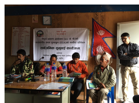
Public hearing in Kailash, Makwanpur