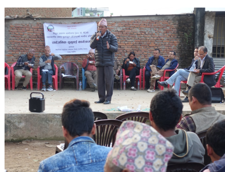
Public hearing in Belkotgadhi, Nuwakot