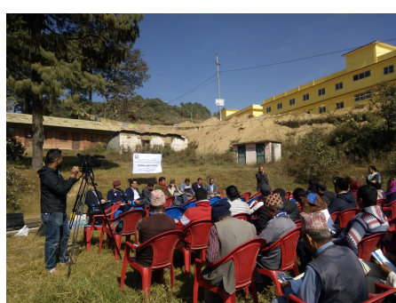
Public hearing in Shankharapur, Kathmandu

MCA-Nepal organized municipality level public hearings from 24 November - 5 December 2019 in all 30 Municipalities of the ten districts which will be affected by the Electricity Transmission Project (ETP) will be implemented. The purpose was to generate awareness of the importance of MCA-Nepal’s ETP, share the draft Environment Impact Assessment (EIA) report, sensitize communities and local stakeholders on the potential social and environmental impact of the project activities and share mitigation measures adopted to address them. The EIA was conducted earlier in areas that will be affected, i.e. 98 wards of 30 municipalities. EIAs are carried out to minimize the adverse impacts on ecological, social and the surrounding physical environment. Considering these socio-environmental impacts, several adjustments were made on the alignment route for the transmission towers. The hearing was an opportunity to share how the EIA has adopted various impact mitigation measures, such as compensation based on resettlement cost, compensation for crops, fruits and plants for the transition period. Public hearings are a mandatory requirement in finalizing the environmental impact study of project areas that will be affected by the Electricity Transmission Project. As a result, many of these municipalities have provided their recommendation to move ahead. A total of 1543 people took part in public hearings out of which about 20% of the participants were women.