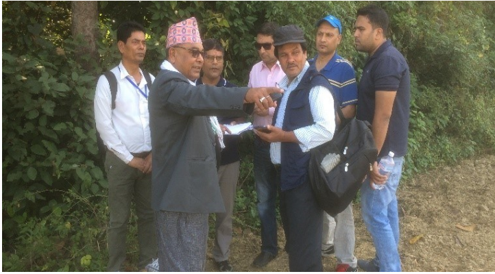
MCA-Nepal team visiting the TL site with the Ward Chair of Ward no. 13 from Sunwal Municipality.

MCA-Nepal team and a consultation group from Stantec visited Parasi District from 7 - 12 November 2019 to consult with local residents, including complainants, municipal representatives and government officials regarding the grievances received and possible solutions. The team also visited the transmission Line path and explored possibilities of alternative routes, evaluated the possible environmental and social impacts due to the proposed changes.